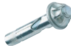
3. Kinmar® Permanent Steel Zinc Plated Sleeve Anchor