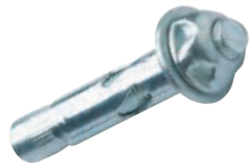
4. Kinmar® Removable Steel Zinc Plated Sleeve Anchor