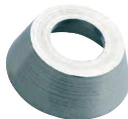
Armour Ring™ Installation Tool