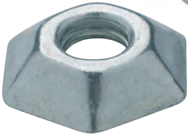
TYPE 2 (M12 only)