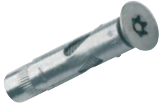
1. Countersunk A2 6-Lobe Pin Sleeve Anchor

Security Anchors save time and money when fixing applications that require a firm hold. They are suitable for fixing to a wide range of base materials such as brick, concrete, stone and masonry. Available in both permanent and removable options... for a hold that stays.