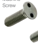
Pan Head A2 Machine Screw