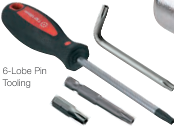
6-Lobe Pin Tooling