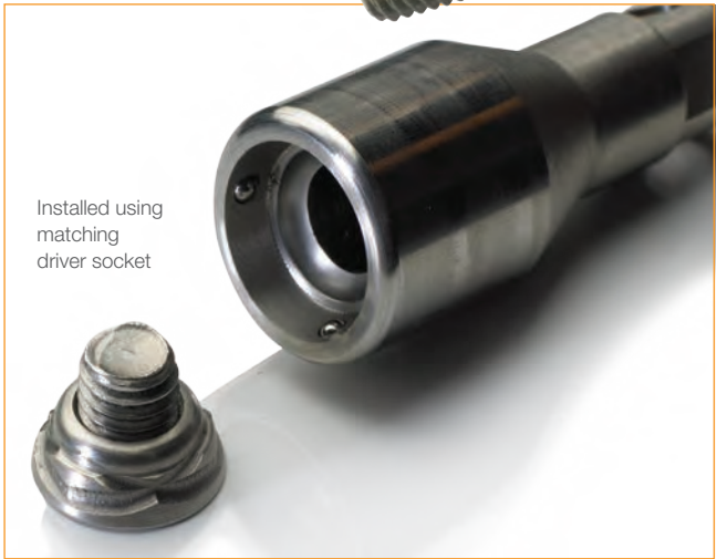
Installed using matching driver socket