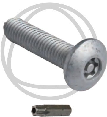
Unique Power6™ Tooling (Not compatible with standard 6-Lobe Pin tooling)