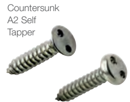
Countersunk A2 Self Tapper