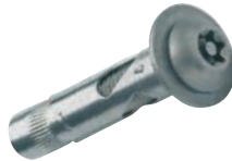
2. Button Head A2 6-Lobe Pin Sleeve Anchor