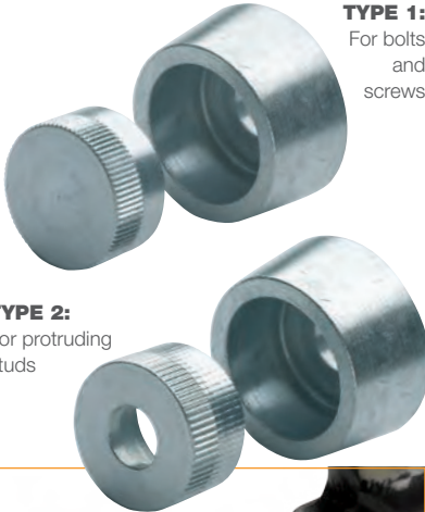
TYPE 1: For bolts and screws