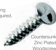
Countersunk Zinc Plated Woodscrew